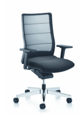
High safety and long service life by minimising costs. Free parts replacement within the warranty period.

Disassembly instructions are available upon request for any interstuhl product